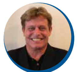
Nathan Kurland Chair